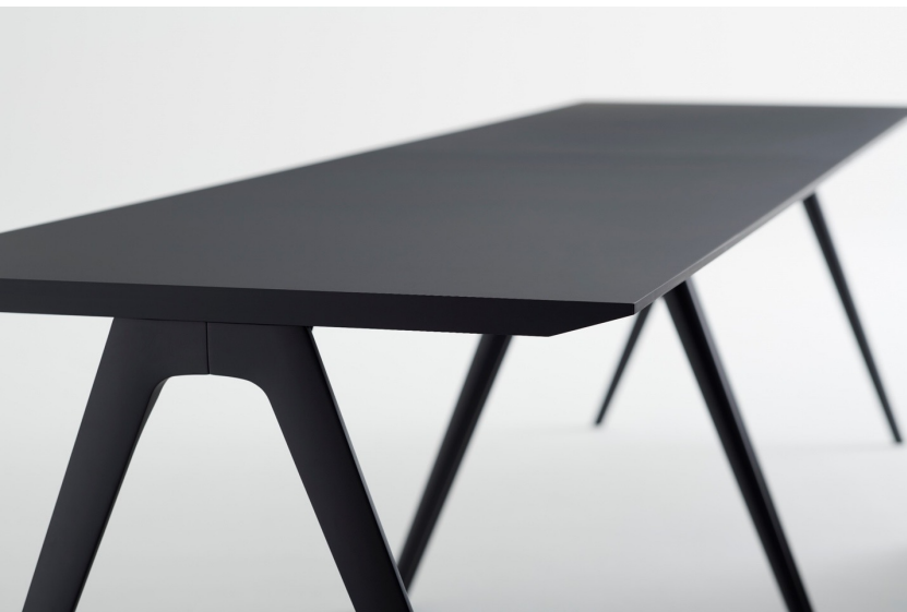
BRUNNER | A-TABLE